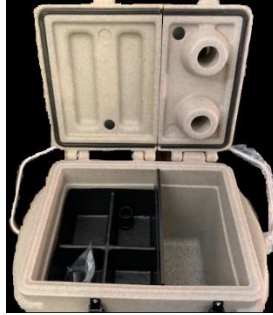
Small Vac Box