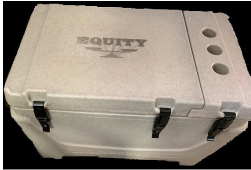
Large Vac Box $275

Get the most out of your vaccine keep them cool, clean, sorted and protected while processing your herd. The Cattlevacbox Boss is double insulated and with the use of icepacks, you can help make sure your meds are kept cool. The specially designed tray keeps your vaccines, injection and transfer needles sorted and individually organized and separated.